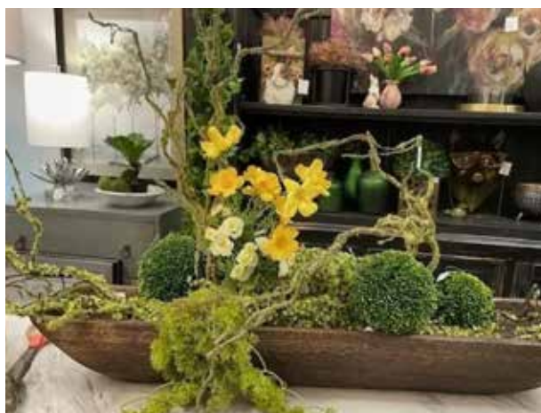
Custom Floral Arrangement from Mary &amp; Martha's