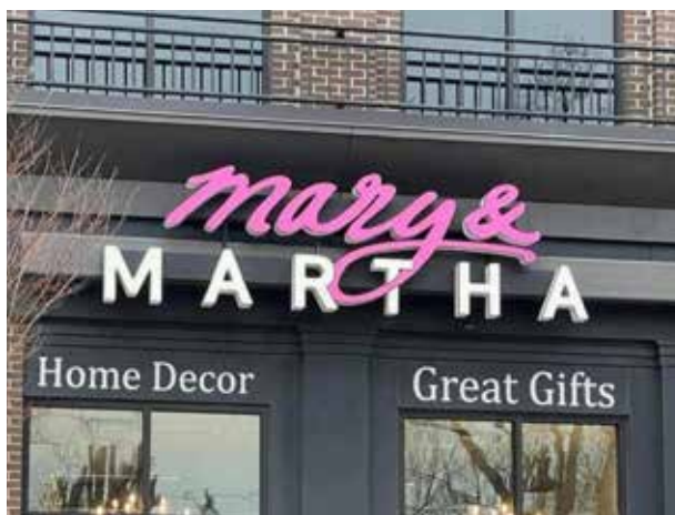
Mary &amp; Martha storefront