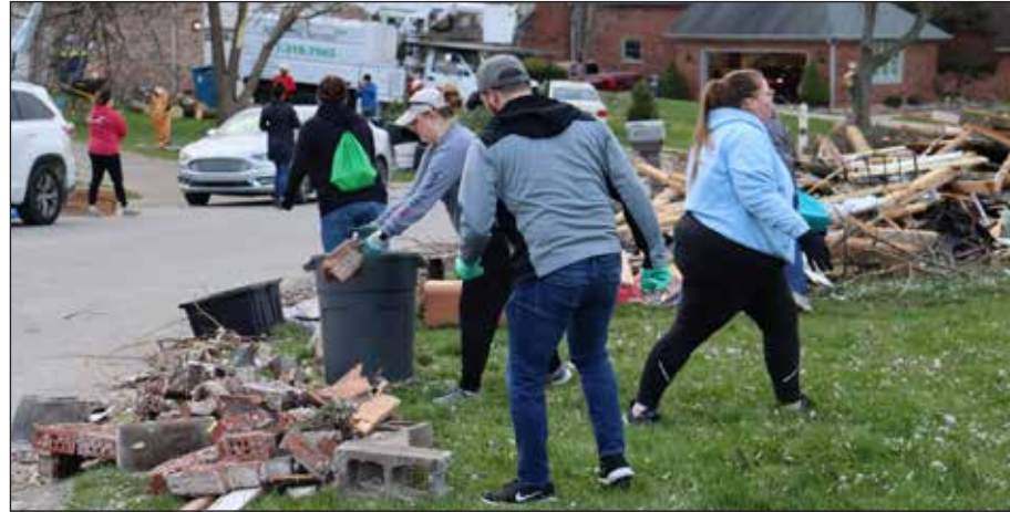
Dozens of Clark-Pleasant staff members gathered at the high school to volunteer for cleanup duty in tornado impacted neighborhoods throughout Whiteland.