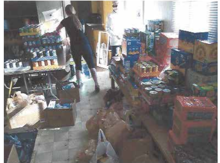
Emmaus Pantry received an abundance of donations in November. (Submitted photo)