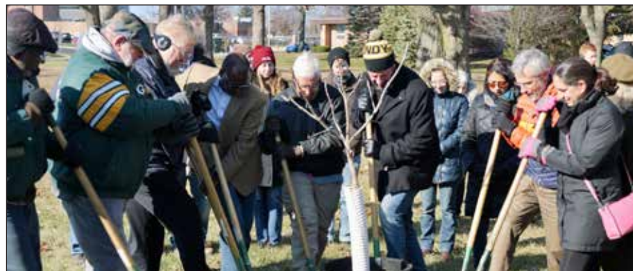
Center for Interfaith Cooperation and Keep Indianapolis Beautiful celebrate "Giving Treesday" with interfaith gathering and tree planting at Lutheran Child and Family Services.

ss-times.com/whiteland-community-rebuilds-after-spring-tornado