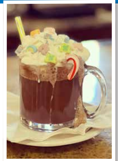
Indulge in a hot chocolate with Lucky Charms resting on whipped cream.

Hours: Daily, 7 a.m. to 2 p.m. Address: 8810 S. Emerson Ave., Indianapolis. For more information, call (317) 851-8614 or go to goldcoffee-indy.com