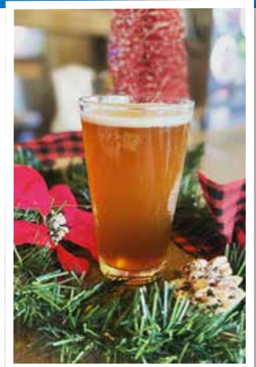
Get into the Christmas spirit with Saint Catherine, one of several holiday-themed brews available during the season.

Hours: Tuesday through Thursday, 4 to 9:30 p.m.; Friday through Sunday, noon to 9:30 p.m.; closed on Monday. Address: 2310 Shelby St., Indianapolis. For more information, call (317) 602-7270 or go to garfieldbrewery.com