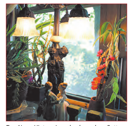
Top, Norm Hinton--I see dead people. Bottom, A flickering lamp. Coincidence?