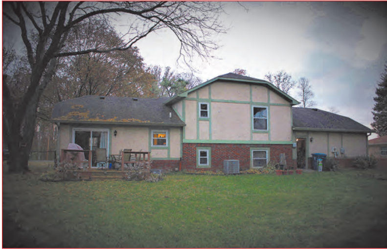
Will the nighttime hours bring comfort or uncertainty?