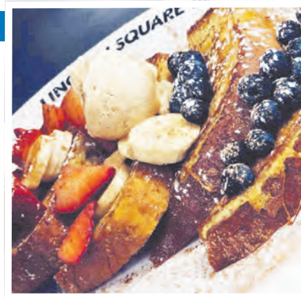
French toast with fresh strawberries, bananas and blueberries. Customers may also add Nutella for their order. (Submitted photo)

Customers looking for the kind of restaurant that serves a wide variety of breakfast items, coffee from large mugs and cheerfulness from the staff may want to check out Lincoln Square Pancake House. The restaurant offers breakfast tacos, chicken and blueberry waffles, various crepes, banana bread French toast, blueberry stuffed pancakes, biscuits and gravy omelets, skillet and more until 3 p.m. As well, Lincoln Square has burgers, salads and sandwiches for those preferring the lunch menu. George Katris, an immigrant from Greece, started Lincoln Square Pancake House in Kokomo, IN in 1989. Katris grew up in a Greek village of 50-60 residents and dreamed of success at a young age. He left his village at the age of just 13 and found work in Athens. Five years later, he boarded a boat to Canada, arriving in Toronto and worked as a dishwasher for $18 a week. After meeting his wife in Greece, he brought her back to Canada. They moved to the U.S. after the birth of