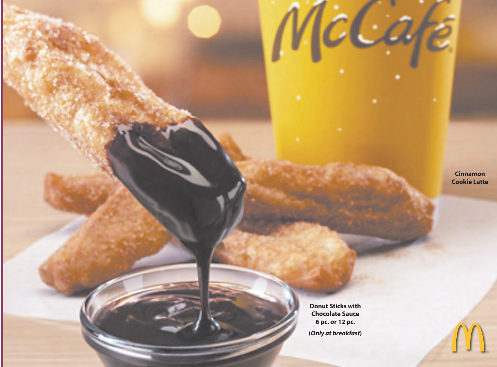
Cinnamon Cookie Latte