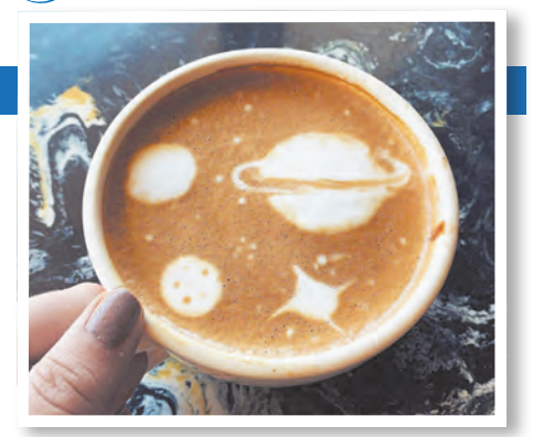
Strange Brew is an eclectic, cozy environment with out-of-this-world coffee names, including Zombie Defense.

"We're very well-know for our Chai, which we brew from scratch," Toni said. "The Pumpkin Sweet Roll is our most popular seasonal drink, with real pumpkin and brown sugar cinnamon syrup combined with espresso, steamed milk and topped with whipped cream. We try to stay as local as possible and keep our money in Indiana. Our coffee is locally roasted every week, making it as fresh as possible." Patrons may purchase bags of coffee and choose from flavors such as Holiday Grog, Zombie