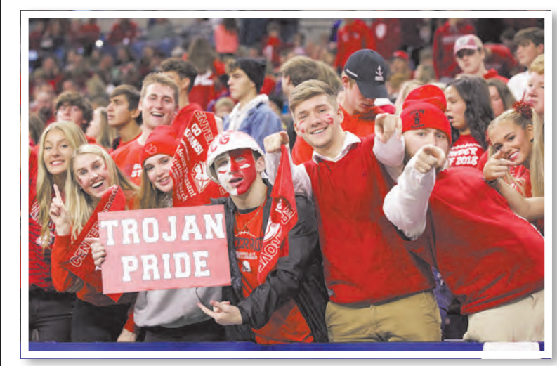
Center Grove students showing off their Trojan Pride!