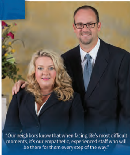
"Our neighbors know that when facing life's most difficult moments, it's our empathetic, experienced staff who will be there for them every step of the way."

There are some topics most people would rather put off. But, whether for yourself or a loved one, funeral planning is easier to do before the need arises. Call or come by for a free copy of our guide. It can make life better for your whole family.