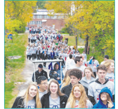
Roncalli's Walkathon, a student fundraiser to raise money for needs-based tuition assistance, was held Oct. 29, 2019. (Submitted photo)