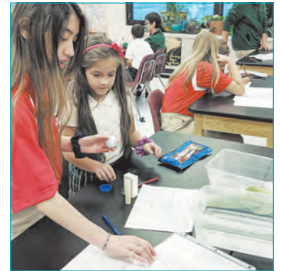
Eighth-graders work a "sink and float" STEM activity with first-graders at Our Lady of Greenwood.