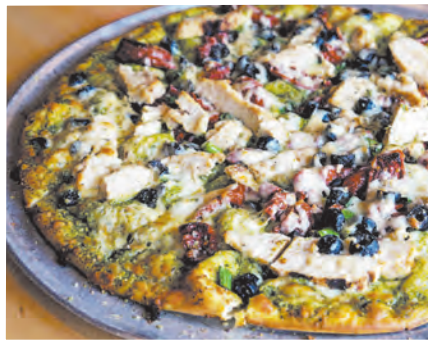
Pizza dough and sauces are made in-house and cheeses are ground daily.