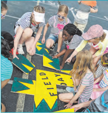
Every May, students from Our Lady of Greenwood participate in field day. (Submitted photo)