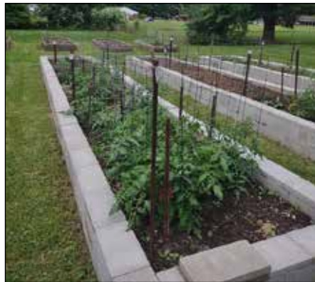
The Garden Committee plans to add more gardening beds as need arises.

Garden updates - The Calvary Community Garden is an outreach to the Southport community. The mission of the garden is to provide opportunities for folks in the community, not just Calvary church members, to have a small plot where they can raise fresh produce. The Community Garden committee plants the unclaimed beds and donates the fresh produce to Hunger Inc. The Community Garden was initially located on the east side of the Calvary property adjacent to Orinoco Ave. Over the past couple of years, the Committee has transitioned the Orinoco in ground beds to raised beds located adjacent to the south parking lot. Improvements at the new site included the construction of 15 four by ten feet raised beds, as well as the construction of a rain-water collection system. The Committee estimates that over 300 volunteer hours went into the various improvements for this year. A four by ten-foot bed can be rented for $20 a season. In spite of the late planting date the harvest was very productive with approximately four hundred pounds of tomatoes, green beans and other vegetables harvested in 2020. These vegeta-