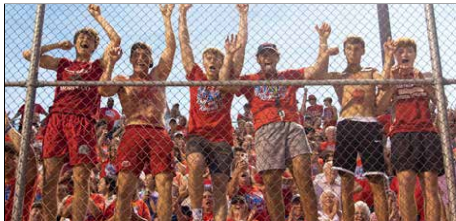
The Roncalli Royals student section celebrate after winning the IHSAA Class 4A state championship. Roncalli is the first school to win the softball championship in three classes.