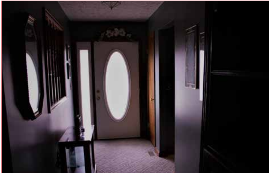
The timeless question that paranormal investigators tend to ask is if they should investigate what is going on behind the doors of their own home.