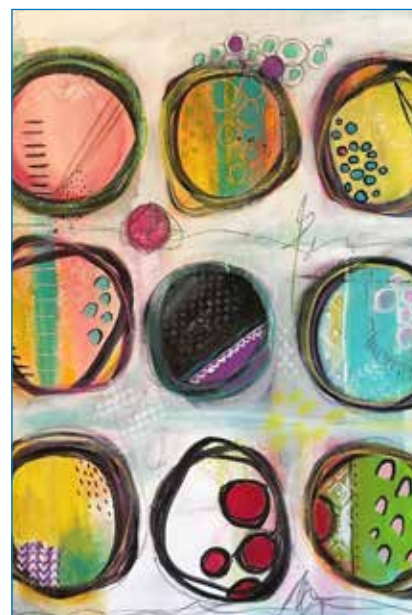
Leslie Ober's artwork features acrylics, soft pastels, watercolor, fabric and mixed media.