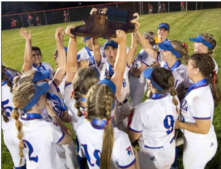
The Roncalli Royals celebrate after winning the IHSAA Class 4A state championship June 12, 2021, at Center Grove High School. The Royals beat the Indians 4-1.