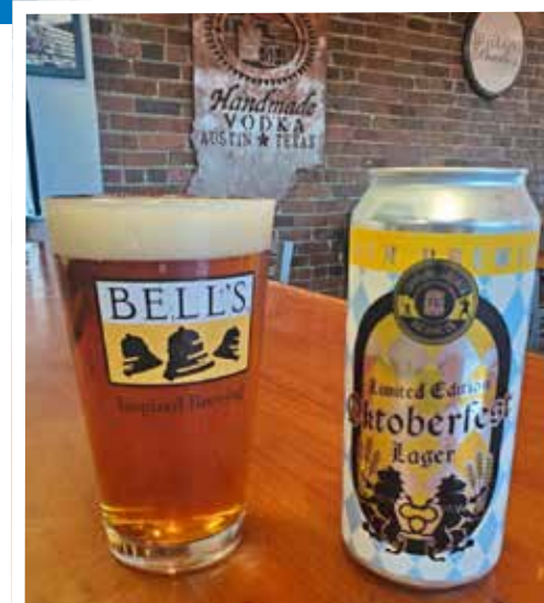
'Tis the season for Oktoberfest – Try Bells on draft or Toppling Goliath in a can.

If your style is more T-shirt and jeans and your idea of a good time is walking your dog to a nearby pub for cheap, good eats, a cold beer and live entertainment on the patio, you need to try Dugout Bar. The Fletcher Place pub was voted Indiana's Best Dive Bar in 2017 by Thrillist, and locals love the hip, fun atmosphere, classic cocktails, potato skins, breaded tenderloin sandwiches, BBQ nachos, deep-fried ravioli and crisp, thin crust pizza. "I'm rating this place 5 stars, not because it's a 5-star restaurant, and they don't try to be. It's 5 stars because they do what they intend to do," stated a Tripadvisor review. "Have a hometown small bar (dive bar) atmosphere for average people to come hang out, meet, eat and enjoy. It is what it is, and it does it in great fashion. We came here at the recommendation of our Airbnb host, and we were happy with the choice. The food was excellent, the beer was cold, and the people were all there to just have some drinks and enjoy an evening out. Same as us!"