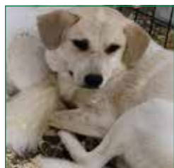
■ ELLIE/ RHONDA: A large, female adult Labrador Retriever and Great Pyrenees mix

These dogs are available for adoption through Tails and Trails Rescue via the nonprofit's Facebook page.