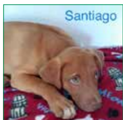
■ SANTIAGO/ MILES: A large male adult Border Collie and Hound mix