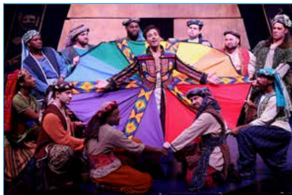
Joseph shows off his coat of many colors that he received as a gift from his father, Jacob, as jealousy rages among his 11 brothers in Beef & Boards Dinner Theatre's production of Joseph and the Amazing Technicolor Dreamcoat, now on stage through Nov. 19.