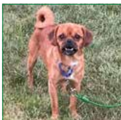
■ PACO: A small male adult Pug and Chihuahua mix