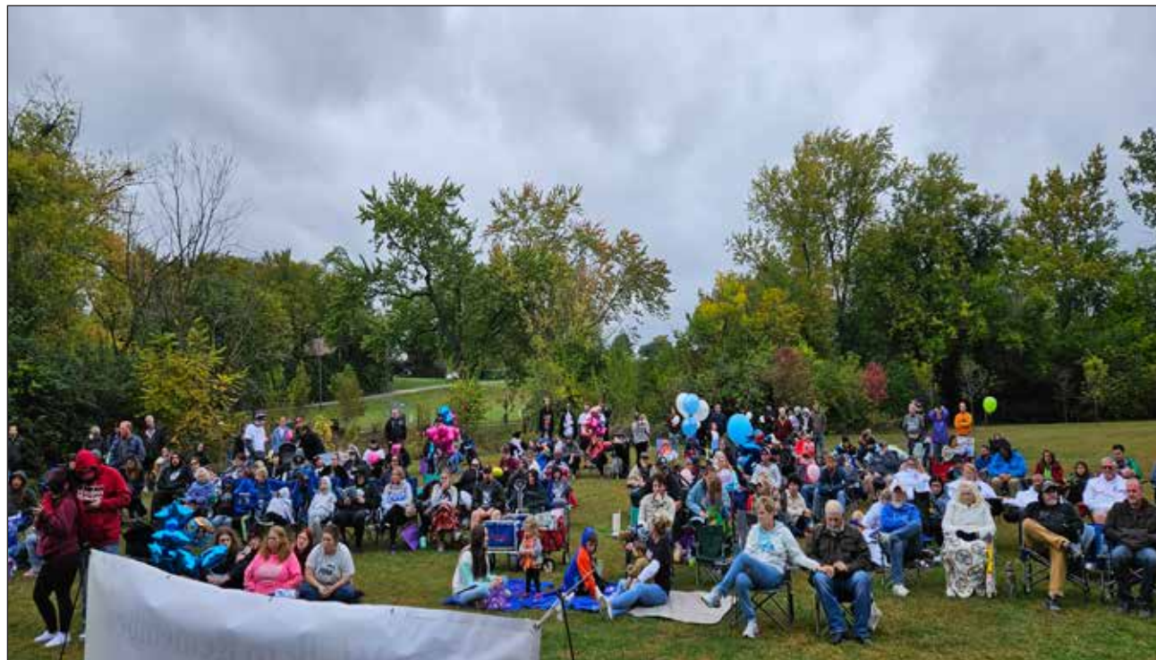
Franciscan Health held its 38th annual Walk to Remember event on Oct. 14 at Beech Grove Elementary School which included hundreds of families from around central Indiana who have lost children through miscarriage, stillbirth or newborn death. These families came together to remember their babies in a service of music, poetry and reading of the infants' names.