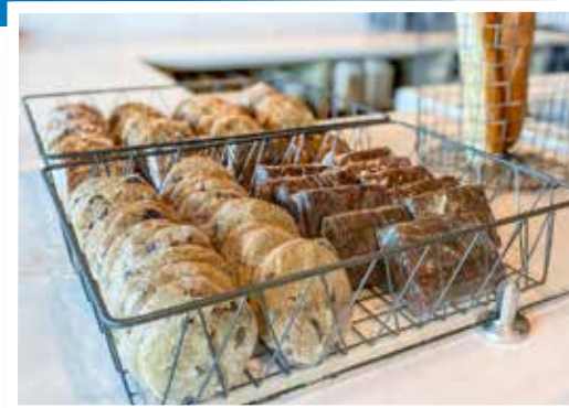
European-style pastries and artisan fresh bread are ready to take home at this new Bargersville location on Baldwin Street.

The owners of Taxman Brewing Company have turned a 19th-century building, previously housing the Masonic Lodge, into a takeout European-style bakery, coffee shop and marketplace. Cellar's Market, which opened in early May, also offers cheese and charcuterie, homemade gelato, fine wine, craft beer and a curated selection of spirits. Looking for a unique gift idea? Try one of their Tulip Tree Creamery cheeses, Smoking Goose meats, DeBrand artisan chocolates, Tinker Coffee, Simple Time Mixers, Modern Sprout Garden Jars, branded T-shirts, cocktail accessories, greeting cards and gift bags. "Beautiful shop!" stated an excited Google reviewer. "My husband loved the coffee selection, and I was impressed by all the varieties of delicious chocolate! My kids were also excited about the gelato and cookies. Lots of unique finds here and great gift options!" Customers also enjoy the flavored margarita mixers this summer and appreciate the pricing.