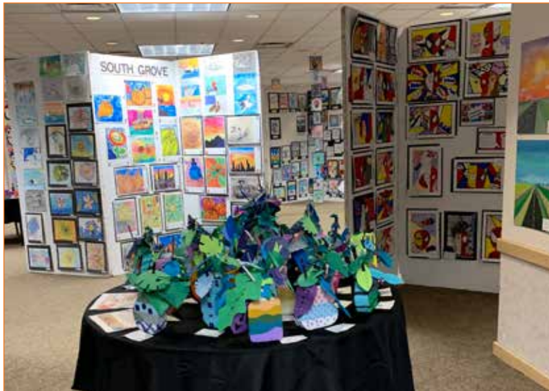
Student works were displayed at Hornet Park Community Center for the annual art show. (Submitted photo)