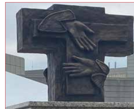
Featuring the tau with two hands, the two-sided monument honors courageous efforts to save lives

To keep up with the crisis level need of sanitizing patient rooms, Elena Mitu, ad-