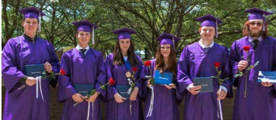
Hope Class of 2023