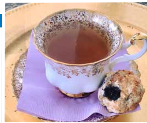
Stop in for a cup of tea and scone to relax for a while or purchase some loose-leaf tea to enjoy at home.

Looking for a unique and classy way to celebrate your wife, sister, mom, grandma, daughter or best friend? Try brunch or an afternoon tea date at the Sassafras Lunch & Tea Room, an idea choice for a wedding anniversary, birthday party, Mother's Day or bridal or baby shower. "We were spoiled for choice with so many wonderful tea blends available, but the friendly server helped us narrow it down," stated a satisfied Facebook reviewer. "The Raspberry Chocolate Truffle tea was my favorite — very raspberry, with the chocolate notes taking a back seat, so it didn't overwhelm the tea." Other guest favorites include Orange-Cinnamon, Honey Pear and Chocolate Cherry Teas. For lunch, options include the Monte Cristo, with cinnamon bread, ham and provolone cheese, topped with powdered sugar and served with apple butter for dipping; the signature Quiche with feta cheese, spinach and sun-dried tomatoes, topped with hollandaise sauce; as well as the Chicken Salad, Southern-