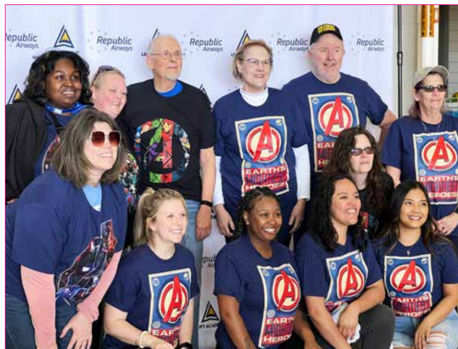
Residents and staff members from Altenheim Senior Living Community.

This time next year, you may see these residents and more pulling another heavy aircraft and lifting people's spirits along the way.