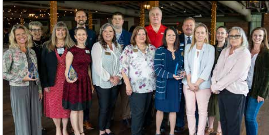
Winners in each category were revealed at the annual "Celebrate Aspire" event held April 27 at the Garment Factory in Franklin. (Submitted photo)