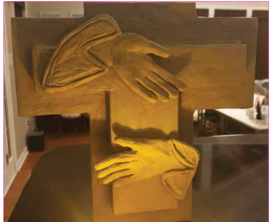
Tau image of the sculpture is a clay model before it is cast in bronze. (Photo courtesy of artist Ryan Feeney)