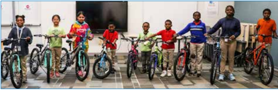
Winchester Village Elementary Students and their bikes.