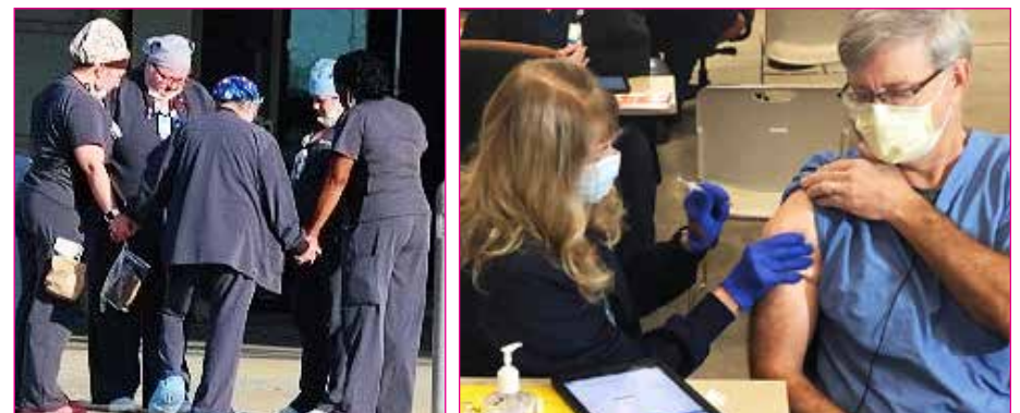
Various images of Franciscan Health Indianapolis staff at work during the pandemic.

erect permanent, identical memorials near key entries at the Indianapolis and Mooresville campuses. Each will include a bronze, double-sided sculpture of the distinct Tau, the symbol St. Francis of Assisi shared as he ministered to the sick. It represents Franciscan Health and honors St. Francis and those who follow his example – Continuing Christ's Ministry in our Franciscan Tradition. Beneath the sculpture will be a bronze plaque worded (Indianapolis or Mooresville, respectively): In Memory of the COVID-19 Pandemic Response at Franciscan Health – A Recognition of Service. The memorial for Franciscan Indianapolis campus will take place May 16, 3 p.m. at 8111 S. Emerson Avenue.