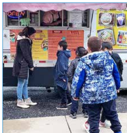
Students were a little nervous waiting in line to use their Spanish language skills.