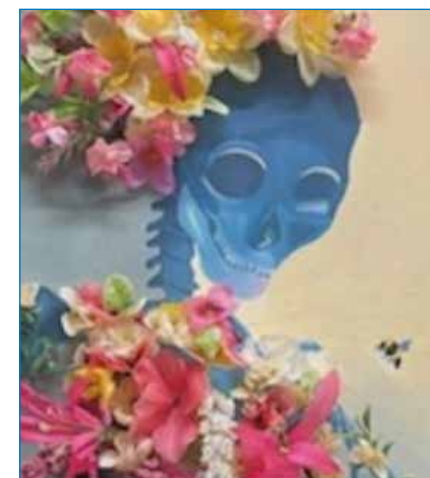
Beech Grove students of all ages will display their artwork at the show on May 16.