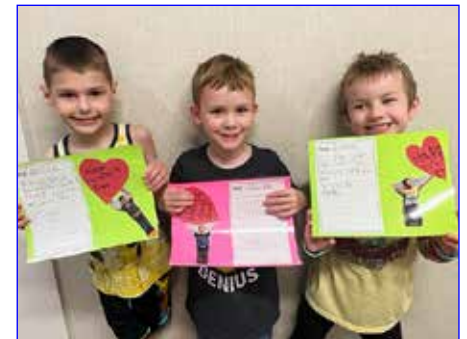
Hornet Park students make picture frames for Mother's Day gifts.