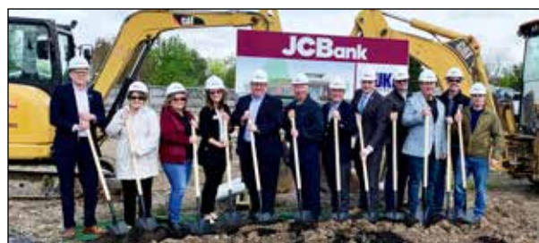
JCBank celebrates the groundbreaking of its 13th branch.

Integrated Healthcare – Meridian Health Services and Franciscan Health announced a new collaboration to provide integrated care for patients at the current Franciscan Behavioral and Psychiatric Health offices located at 5230 E. Stop 11 Road, Suites 300, 350, and 380 in Indianapolis, and 1001 Hadley Road, Suite 103 in Mooresville, Ind. The high-quality behavioral and psychiatric healthcare that patients have come to count on will be complemented by a new and wider spectrum of integrated care specialties that Meridian has to offer. Meridian Health Services is a regional, integrated healthcare system that believes in treating the “whole person” by caring for the physical, mental and social well-being of people to help achieve their optimum health. Patients will have access to an expansion of services, introducing primary medical care combined with behavioral health for total well-being. Services include psychiatric care, family medical care, medication assisted treatment (MAT) and other addictions and recovery services, skill building, therapy and counseling and more behavioral health services. For more information, visit MeridianHS.org or call 866-306-2647.