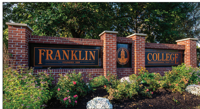
Franklin College has advanced in Top Performers for Social Mobility and Best National Liberal Arts College.