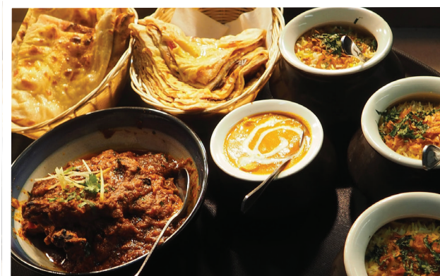
Meat lover or vegetarian? Hot and spicy or mild? Whatever your preference, Swagat Indian Cuisine has a variety of options for everyone.

Locals may not find a lively or exciting atmosphere in Swagat Indian Cuisine, but they love the locally owned restaurant's many options for plenty of packed flavor, large portions, prompt and friendly wait staff and lunch specials. Guests can't get enough of the Tandoori Roti, Lamb Biryani, Butter Chicken, Chicken Tikka Masala, Tikki Aloo (spiced potato cakes) and paneer pakora (deep fried cheese). "The vegetarian menu is incredible! I personally cannot get enough of the Nav Ratan Sahi Korma with the Kashmiri Naan," stated a Facebook review. "Seriously the best Indian food I've ever had," added a Google reviewer. "Everything came out STEAMING hot and fresh. The Garlic Naan was amazing, but the mixed Tandoori Grill was incredibly impressive. The