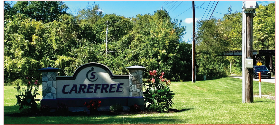
(Cover) The main entrance to the Carefree South Neighborhood. | (Left) The Oxford House. | (Top right) One entrance to Carefree South is across the street from North Grove Elementary School. | (Bottom right) The Carefree South Neighborhood in Greenwood.