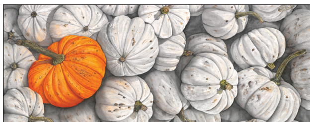
The Orange Pumpkin. (Art by Brenda Pettigrew)