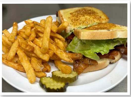
The Bee-Boppin BLT with fries.

Visitors enjoy the restaurant's interior, including a 1957 Chevrolet Bel Air car booth and a 1985 Ford Mustang hostess stand. "They have décor from 'I Love Lucy,' Betty Boop, a jukebox, Coke, all kinds of old cars, musicians, movies, and there's a TV playing black-and-white movies," according to a Google review. If you're feeling brave, try the '57 Chevy Burger Challenge: wolf down two onepound burgers (with all the toppings), along with